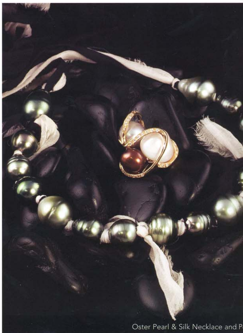
Oster Pearl & Silk Necklace and P