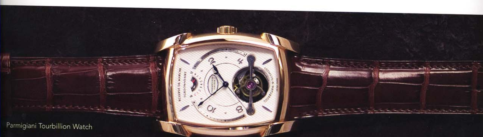
Parmigiani Tourbillon Watch