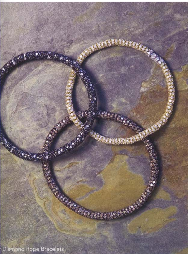
Diamond Rope Bracelets