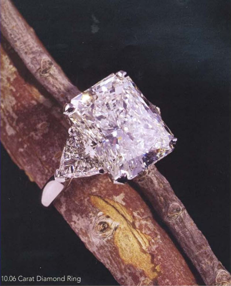
10.06 Carat Diamond Ring