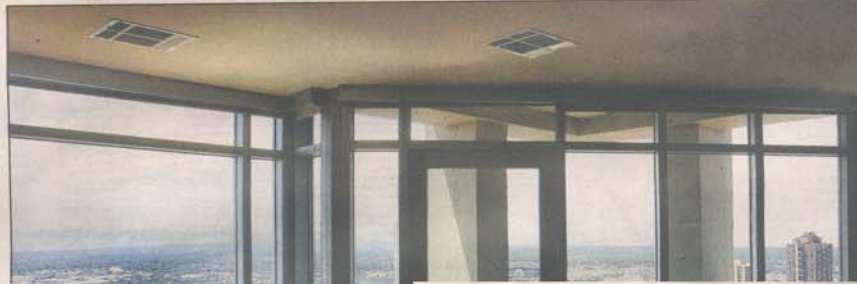
The view from the most expensive apartment in Denver, at 16

■ Hala Ranch ■ Where: Aspen ■ Price: $135 million Fit for a prince (Prince Bandar bin Sultan, to be exact), this 95-acre site includes a 56,000-square-foot main house (15 bedrooms), indoor pool, indoor racquetball court, waterfall and a beauty room for pedicure massages and styling services; forget tennis courts, fishing ponds, heated horse stables and resort for staff. There's even a mecha shop complete with gas pumps; car wash.